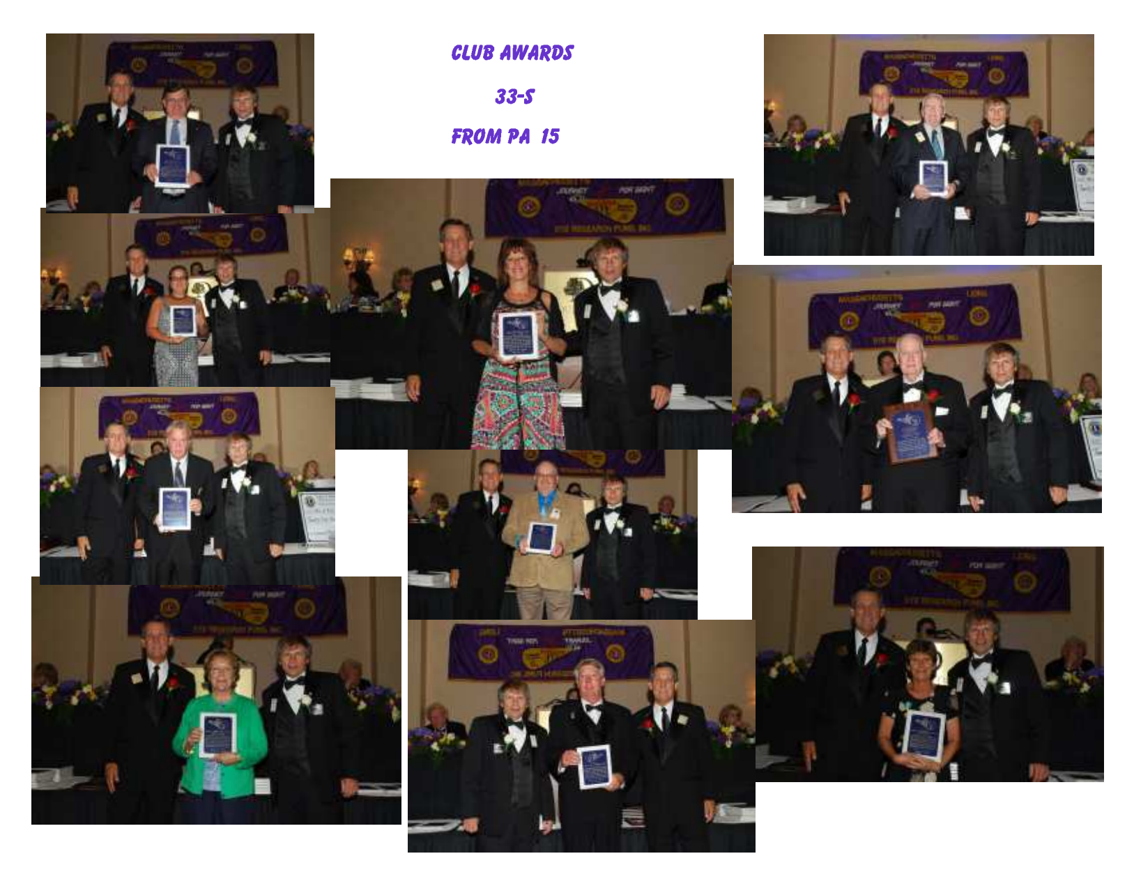
MORE BANQUET HIGHLIGHTS