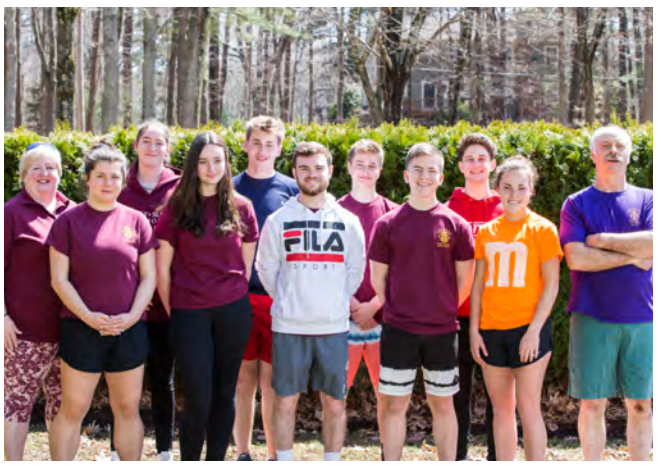
DISTRICT 33K LEOS