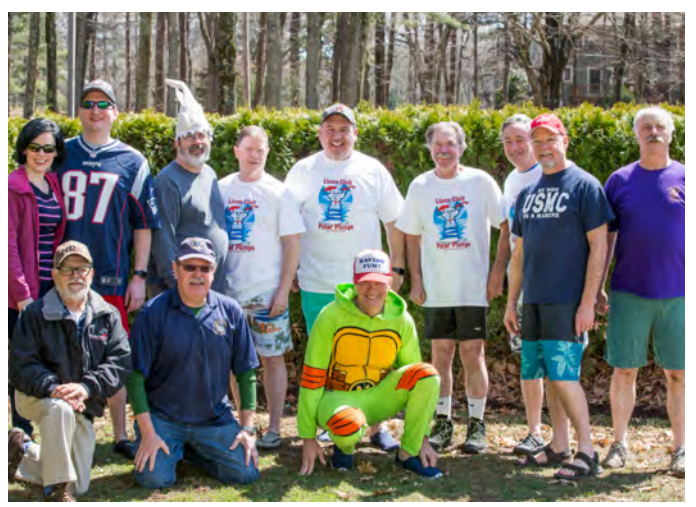
WRENTHAM LIONS CLUB