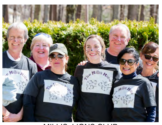
MILLIS LIONS CLUB